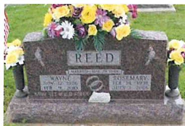
Added by RWCNAC